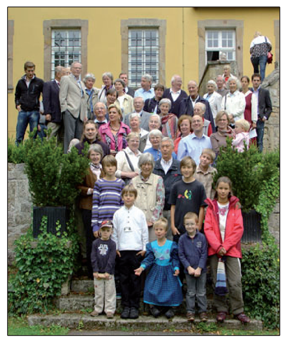
members of the family reunion at Höhnscheid Castle

6th reunion of the Baltic branch at Höhnscheid