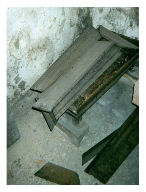
This is what the coffin looked like