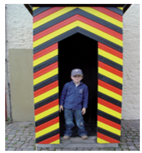
One of the youngsters standing guard.

Perhaps our next reunion will be in Sweden in 2012.