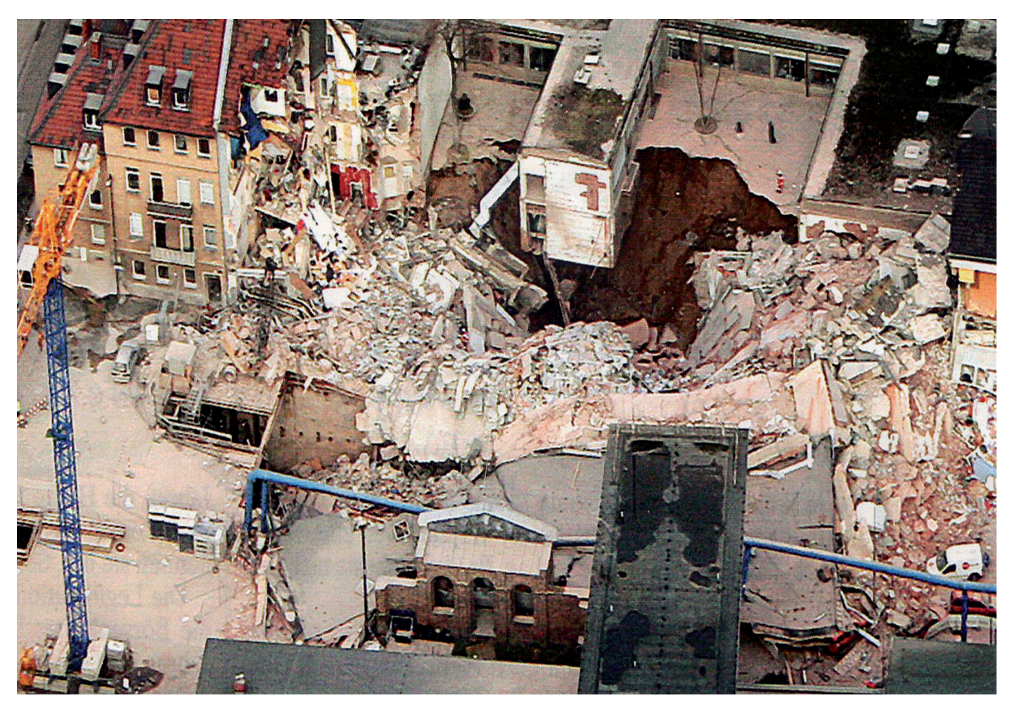
The building of the Historical Archive of Cologne collapsed like a house of cards