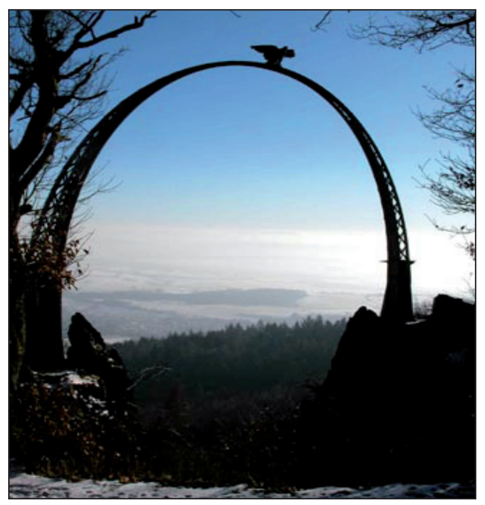
The Eagle Arch on the Rock of Moltke near Kaiserslautern

then was called "Dorbisfelsen". The curved iron structure (triumphal arch) was meant to be in honour of Field Marshal Graf Helmuth von Moltke, who had an important share in the victory of the Franco-Prussian War 1870/71, by which people believed him to have secured the Palatine borders. The monument is crowned by the figure of a cast iron eagle. Originally two cast iron statues of Moltke and the Chancellor of the Reich, Fürst Otto von Bismarck, were standing at the foot of the arch, but they were destroyed by unknown persons after World War II. In 1945