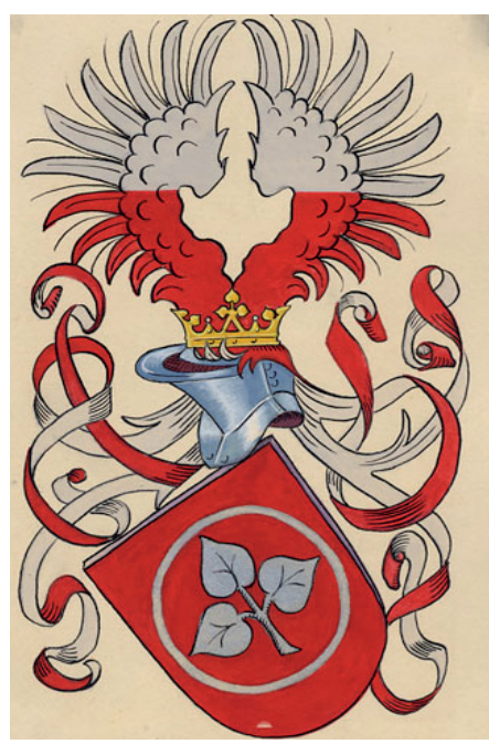
coat of arms in Thuringia